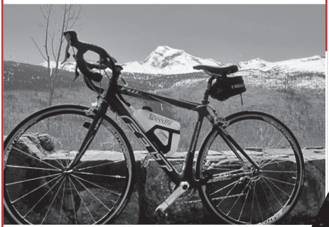
Majestic Glacier Park

On Saturday, July 28, 2012, there will be a local ride to benefit CASA for Kids of Flathead County. The event will begin at the fitness center at Meadow Lake Resort and then proceed to Bigfork with a return to Meadow Lake Resort. For those who have participated in the Park to Park ride in previous years this is a "mini" trip of just 80 miles! Lunch will be provided along the route as well as at the end of the ride! Join us for a great outdoor event!